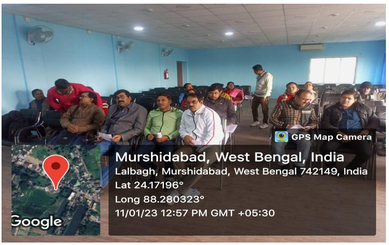
NMSM faculty member participated in Meeting for Inter college sports at Lalgola College