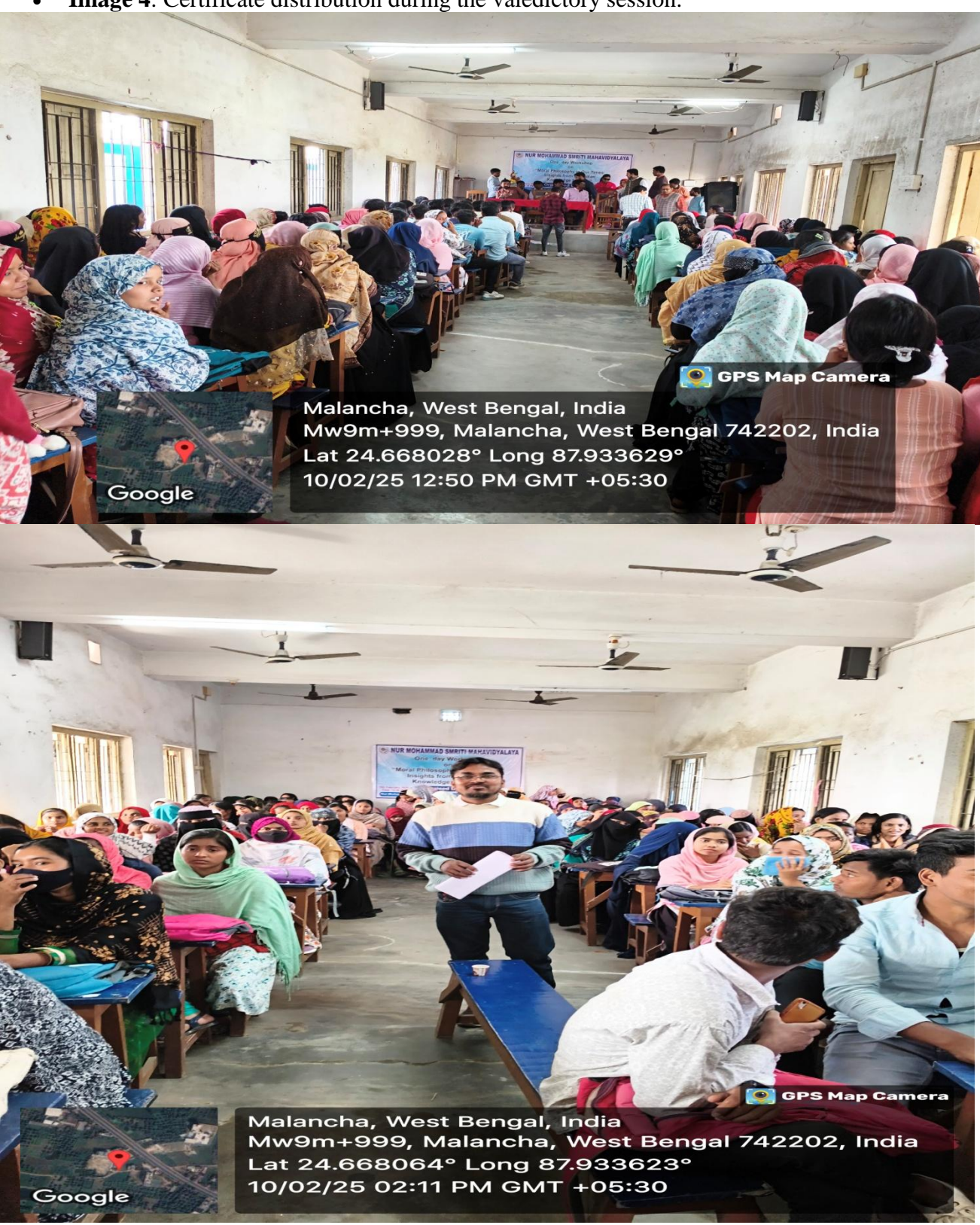
Image 4 : Certificate distribution during the valedictory session.

These images are stored in the college's digital archive and can be accessed via the IQAC office.