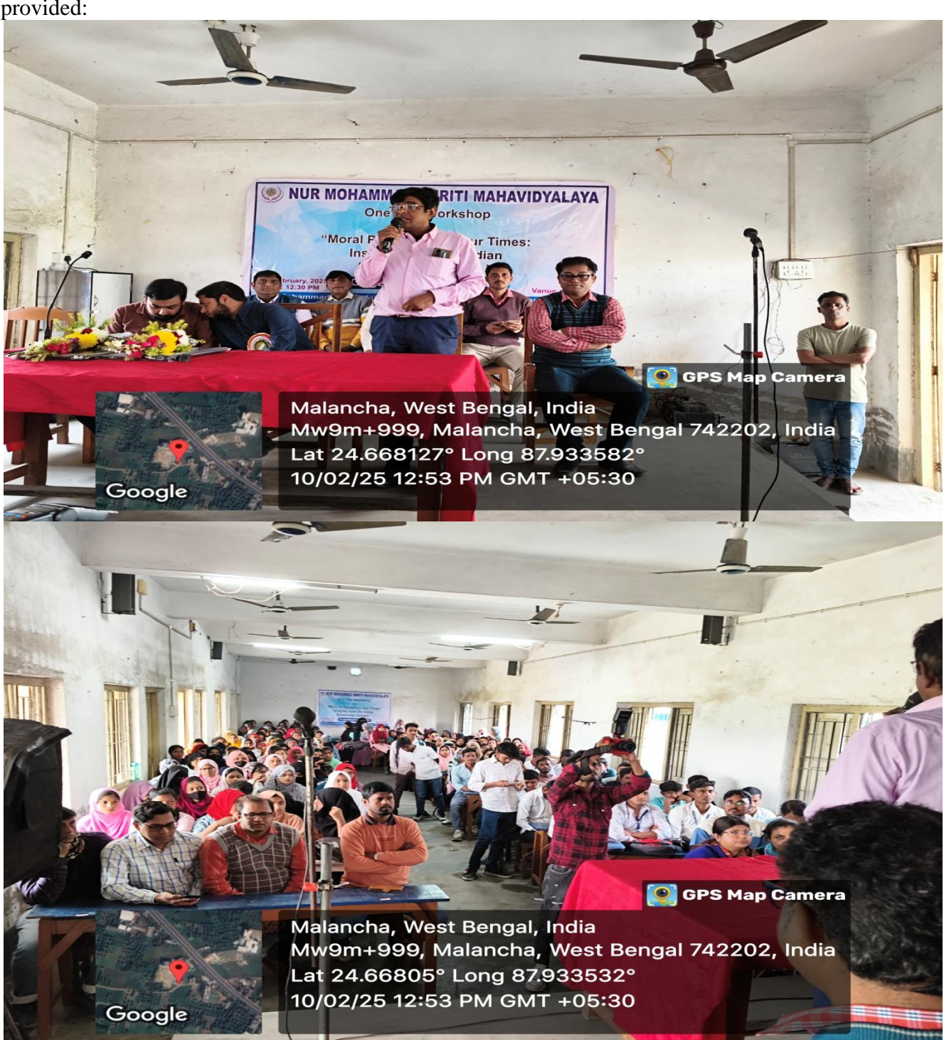
Image 1: Group photo of participants with keynote speaker and principal during the inaugural session.