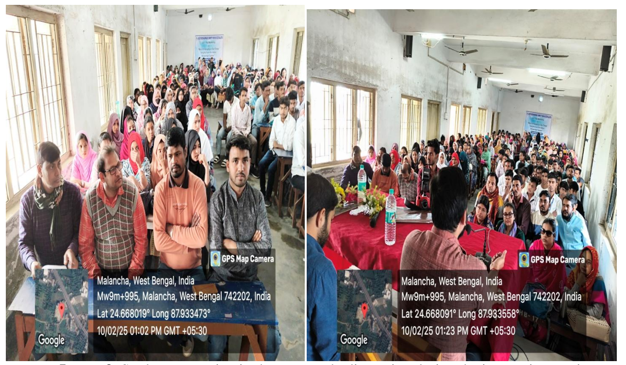
• Image 3: Students engaging in the case study discussion during the interactive session.